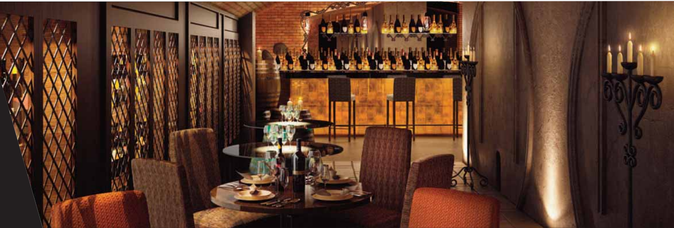
Bakchus Wine bar with zonal areas for different entertaining