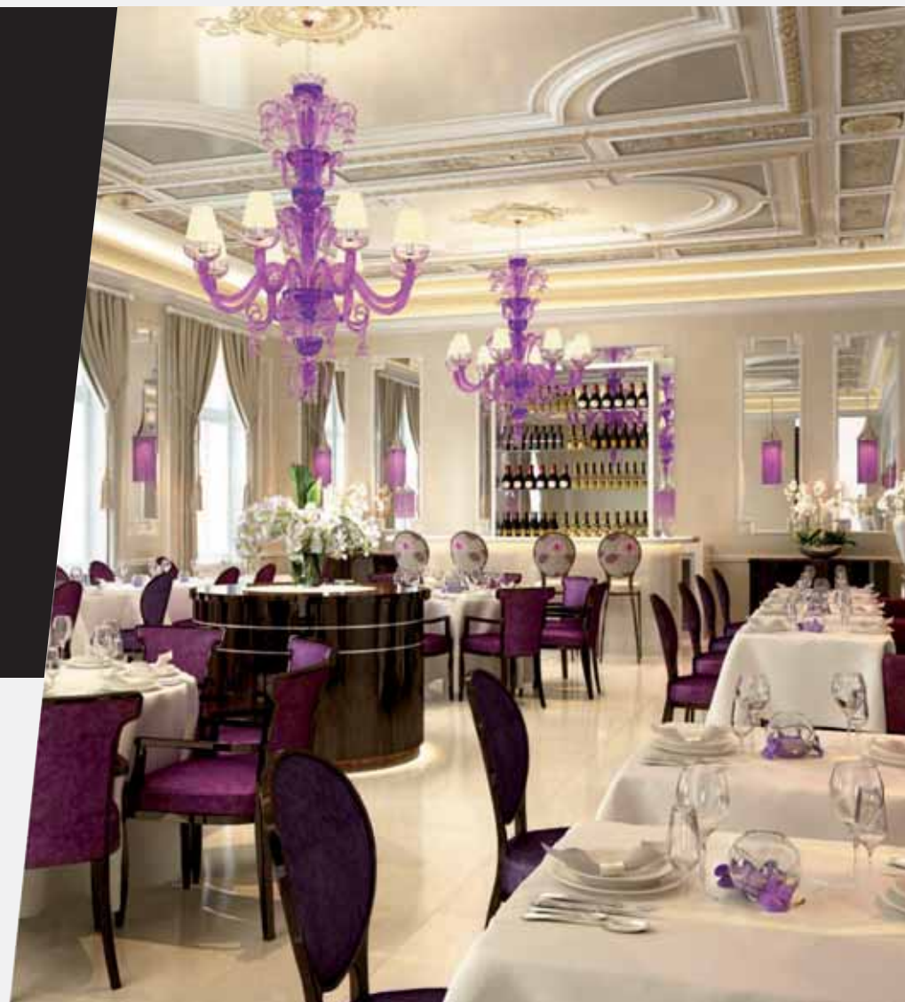
The dining experience

While the most beautiful dining room in Bratislava provides a ravishing background for the superb food