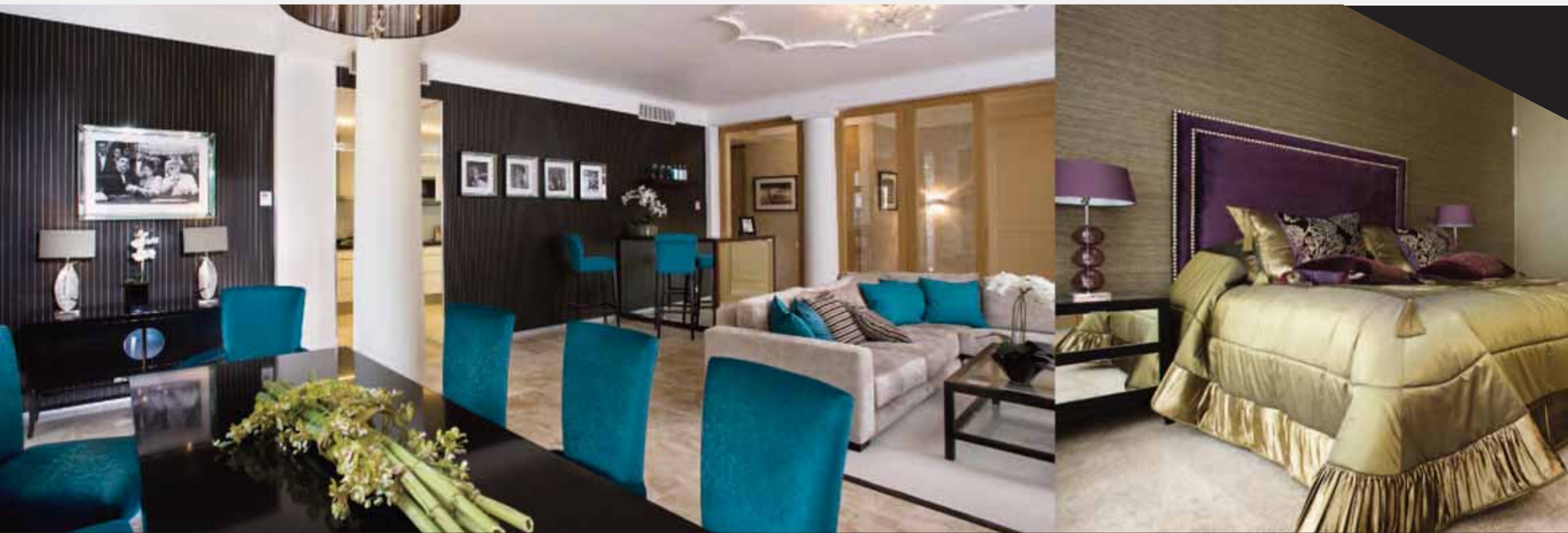
Simple zoning for family living | Sumptuous and comfortable bedrooms.

To create an ultra-desirable and inspirational living space where your every whim and need are catered for.