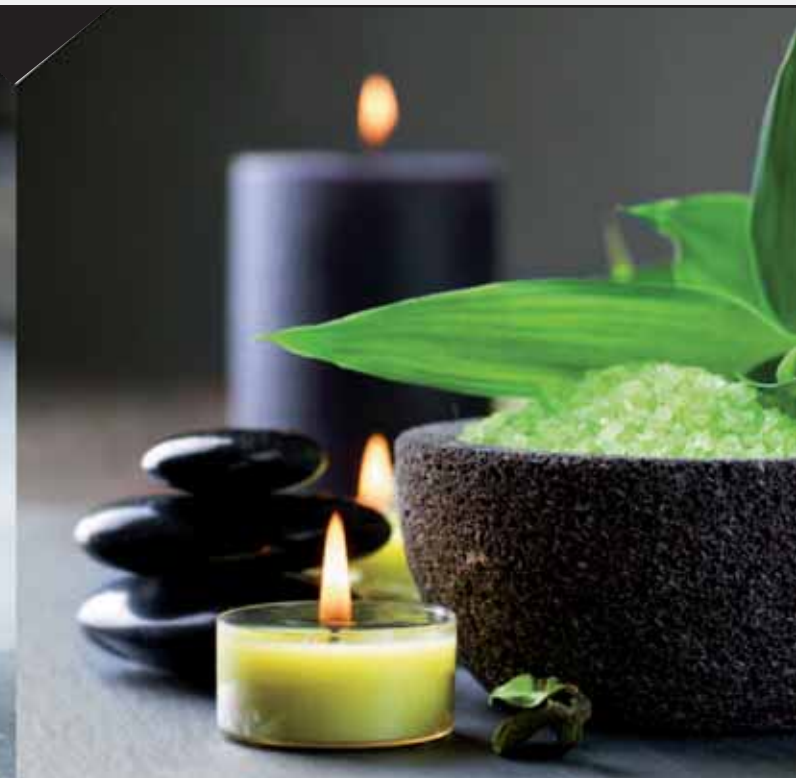
Relaxing in the 7 Spa